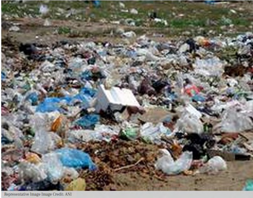
Representative Image

PTI | Mumbai | Updated: 02-12-2020 17:57 IST | Created: 02-12-2020 17:00 IST