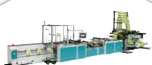
Wicket Bag Making Machine