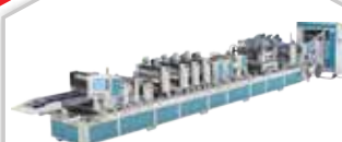
Stand Up Zipper Pouch Machine