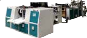
High Speed Bag On Roll Machine for coreless & On-core bag

Plastic Bag Making Machines | Pouch Making Machines | PVC Label Machines | Special Tailored Machines