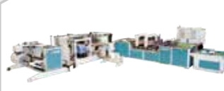
High Speed Courier & Security Bag