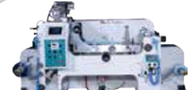
PVC Shrink Label Sleeving Machine