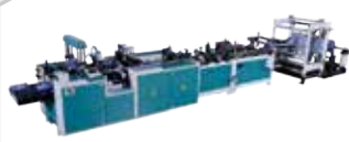
Combined 3 Side & Center Seal Pouch Making Machine