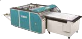
Bottom Seal Heavy Duty Bag Making Machine