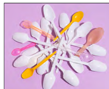
SINGLE USE SPOONS