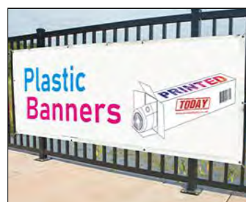
PLASTIC OR PVC BANNERS LESS THAN 100 MICRON