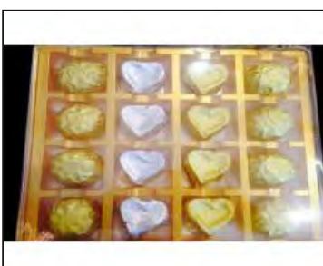
WRAPPING OR PACKING FILMS AROUND SWEET BOXES