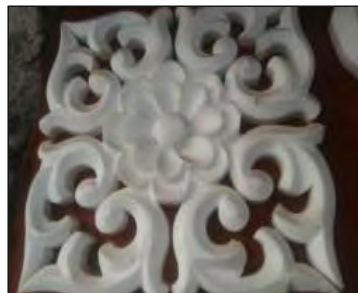
POLYSTYRENE (THERMOCOL) FOR DECORATION