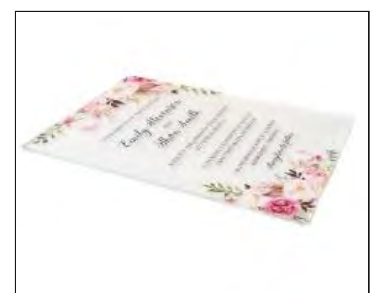
WRAPPING OR PACKING FILMS AROUND INVITATION CARDS