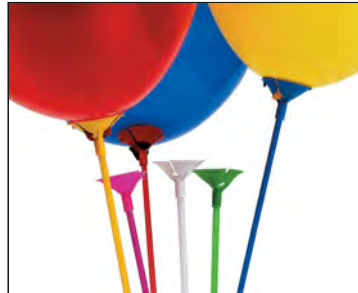
PLASTIC STICKS FOR BALLOONS