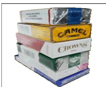
WRAPPING OR PACKING FILMS AROUND CIGARETTE PACKETS