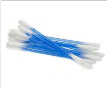
EARBUDS WITH PLASTIC STICKS

List of Single Use Plastics Items Banned from 1 st July, 2022 as per Plastic Waste Management Rules (Amendment) 2021 notified by the Ministry of Environment, Forest & Climate Change, Government of India